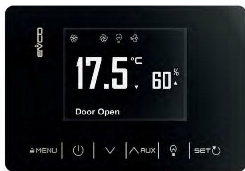
Touch control board