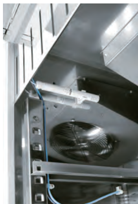
Electronic probe for humidity control