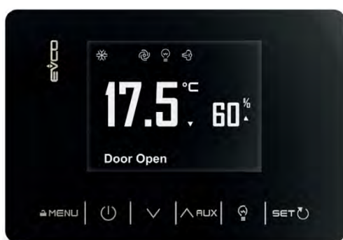
Touch control board