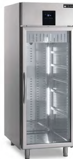
Glass door version with LED lightning