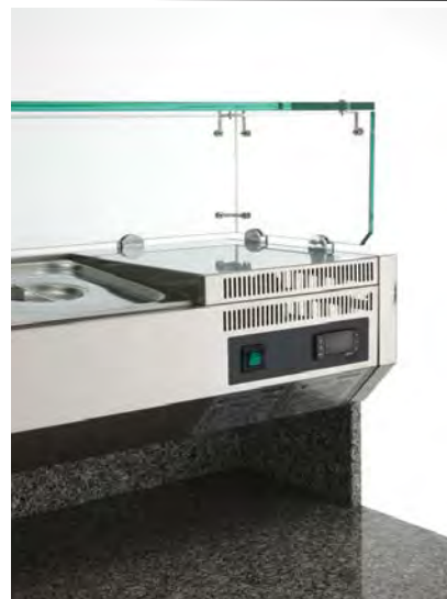
Refrigerated display cabinet details (GN trays not included)