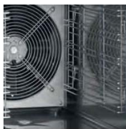
Detail of internal ventilation